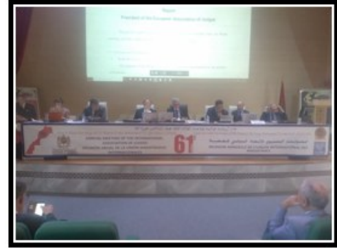
The four IAJ Regional Groups met in Marrakesh on October 14 th .