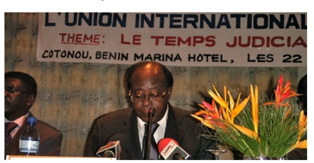
The President of the Supreme Court of Appeal of Benin