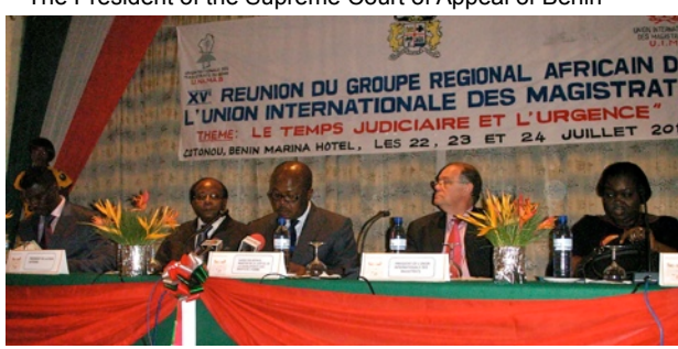
The Minister of Justice, legislation and Human Rights of Benin