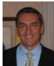
Mr. Antonio MURA Court of Cassation Judge, "Sostituto Procuratore Generale" of the Supreme Court of Italy