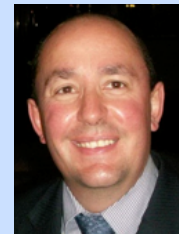
Editor of the IAJ newsletter