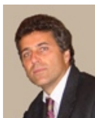
Mr. Lucio ASCHETTINO, Judge of the Criminal Court of Naples (Italy)