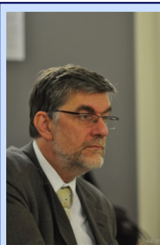
Justice Gerhard Reissner President of the European Regional Group

On the 6th of May 2011 the European Association of Judges met in Malta. The meeting was hosted by the Maltese Association of Judges. The countries that attended were Armenia, Austria, Azerbaijan, Belgium, Bulgaria, Croatia, Cyprus, Denmark, Estonia, Finland, France, Germany, Hungary, Iceland, Israel, Italy, Latvia, Liechtenstein, Lithuania, Luxembourg, Malta, Moldova, Netherlands, Norway, Poland, Portugal, Slovakia, Slovenia, Spain, Sweden, Switzerland, Turkey, Ukraine and United Kingdom.