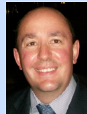
Editor of the IAJ newsletter