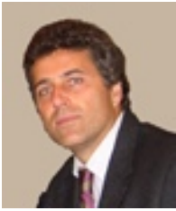
Mr. Lucio ASCHETTINO, Judge of the Criminal Court of Naples (Italy)