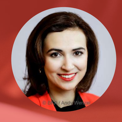
H.E. Ms. Alma Zadić Minister of Justice of Austria